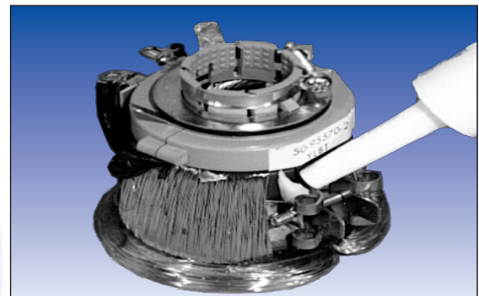
4460 Penetrates and Encapsulates a Tightly Wound Coil