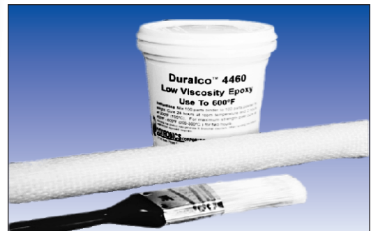
4460 Coats, Moisture Proofs, Seals and Protects Ceramic Sleaving